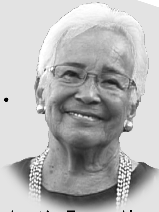
Auntie Fanny Ahoy

"Let's protect our 'aina and our ocean. Please remember to bring your reusable bags."